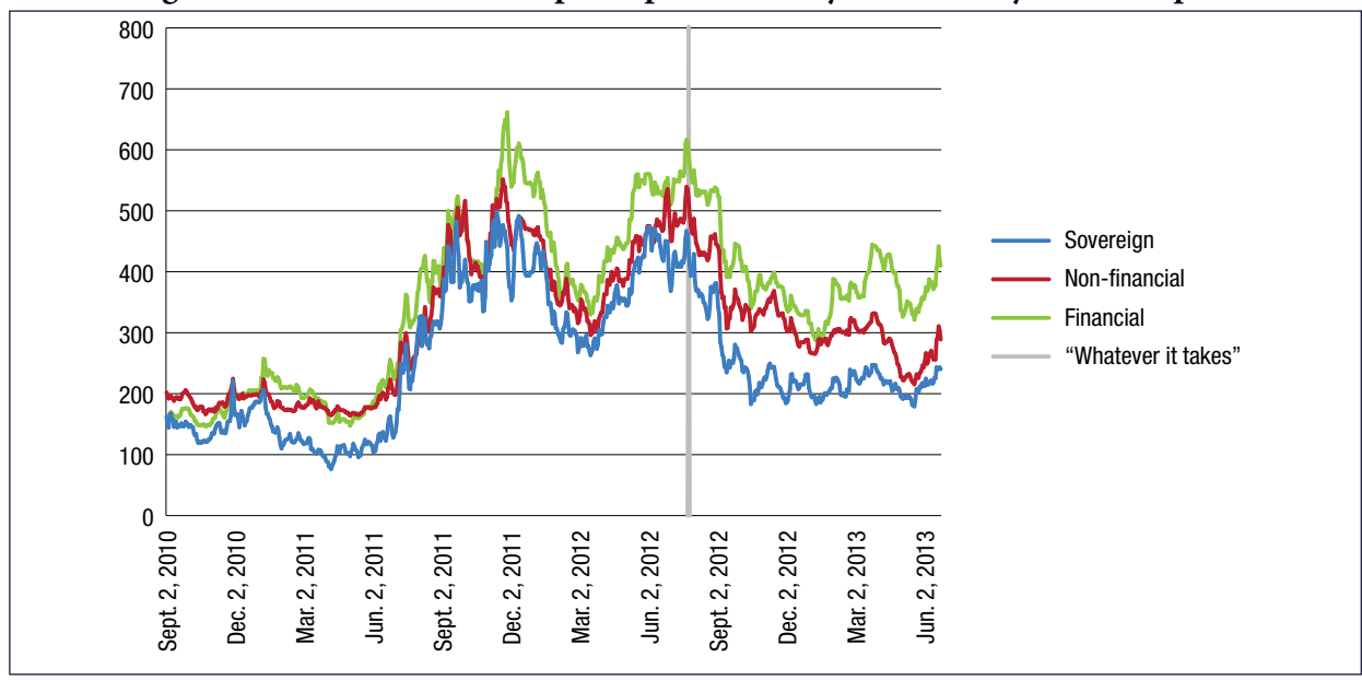
Figure 2b: Credit default swap risk premia on 5 year bonds by sector - Spain

Note : The non-financial and financial series refer to the unweighted average of bonds by the five largest financial and non-financial corporations in the country.